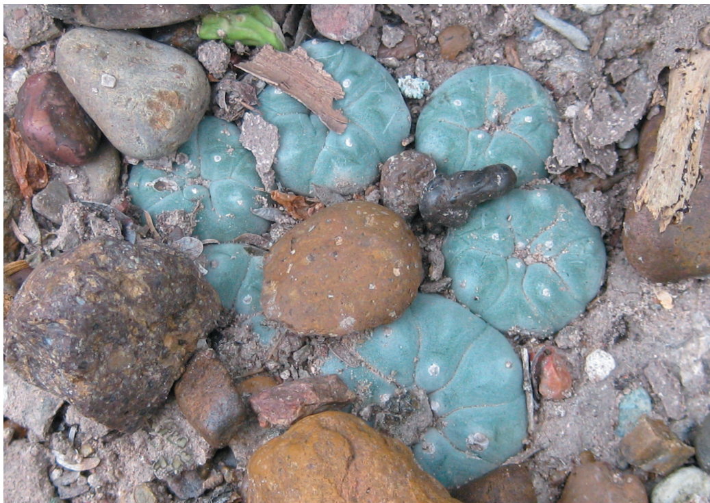
FIG. 1b. Six small peyote cacti (diameter of largest individual is ca. 4 cm) in habitat in Tamaulipan Thornscrub. The circular grouping and small size indicate that these plants are regrowth resulting from the harvesting of the crown of the parent plant (not visible) by peyote cutters in recent years.