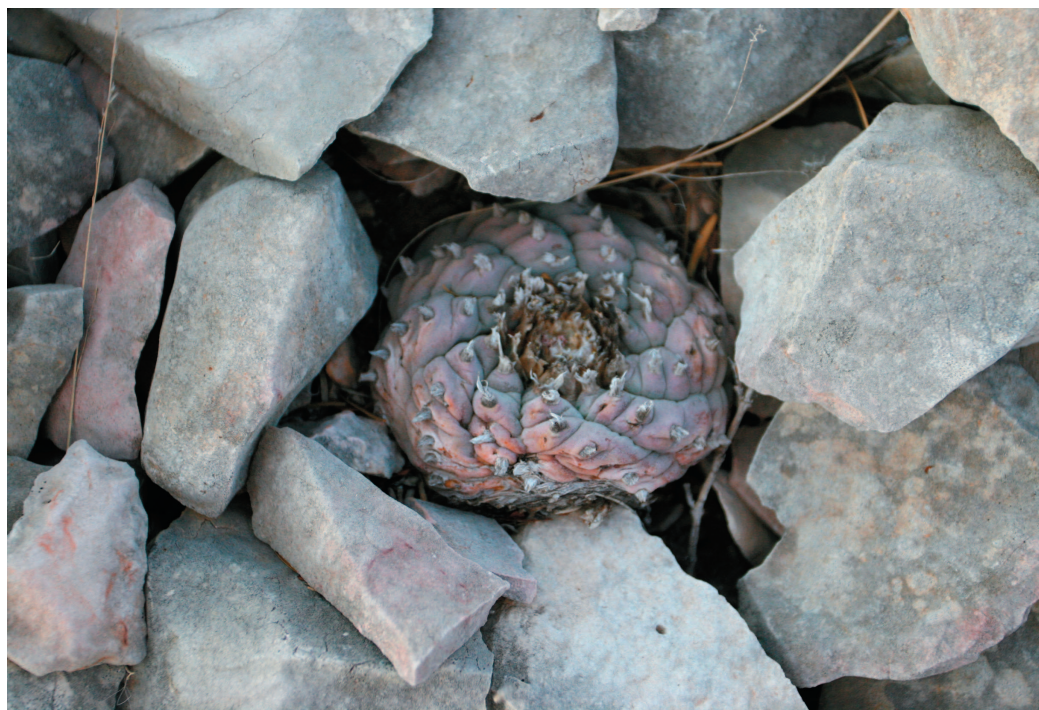
FIG. 2. "Purple peyote" in habitat in Chihuahuan Desert. Plant shows reddish betalain pigment and depleted chlorophyll resulting from the severe drought of 2010–2011.

In order to eliminate the possible confounding factors of drought stress and dehydration from this geographic phytochemical analysis, we collected all the peyote tissue samples during the rainy season in July 2010 and desiccated the tissue samples prior to analysis. There is an untested but prevalent belief among NAC members that older/larger peyote plants constitute "stronger medicine" than younger/smaller plants (Teodoso Herrera, pers. comm. based on his personal experience as spiritual leader of the Native American Church of the Rio Grande, and on the opinions of his numerous NAC colleagues). Accordingly, in order to eliminate the possible confounding factor of different stages of maturity of the plants sampled for this study, we collected tissue samples exclusively from individuals with eight ribs, which are young adult plants that are typically ca. 3–5 cm in diameter (Terry et al., unpublished data).