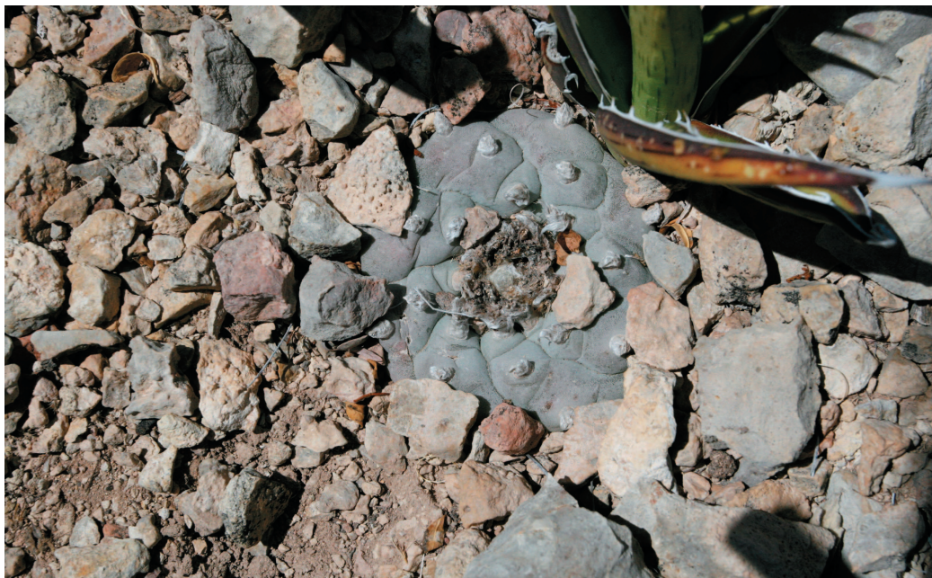
FIG. 1a. An adult peyote cactus (diameter ca. 6 cm) in habitat in Chihuahuan Desert.